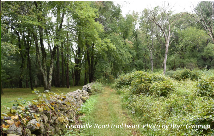
Granville Road trail head.