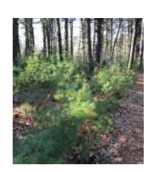
Many young white pine trees?