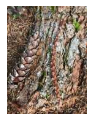
A pine cone and one that has had its scales stripped?