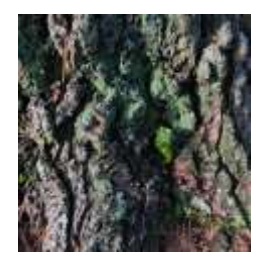
A tree with moss and lichen on the trunk or branches?