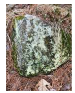
a rock covered with moss and lichen?