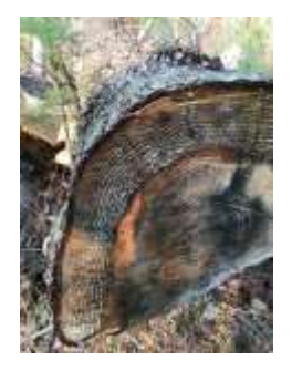
A sawed-off tree trunk where you can count the rings? How many can you count?