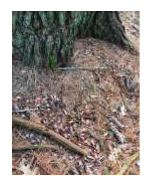
A pile of pine cone scales and cones on the forest floor?