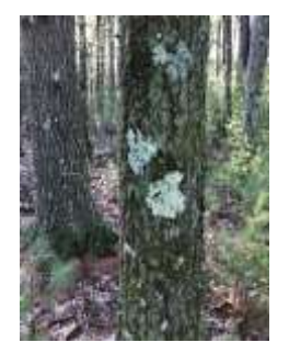
This type of lichen on a tree trunk or branch?