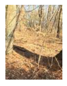
An oak tree still with last year's leaves?