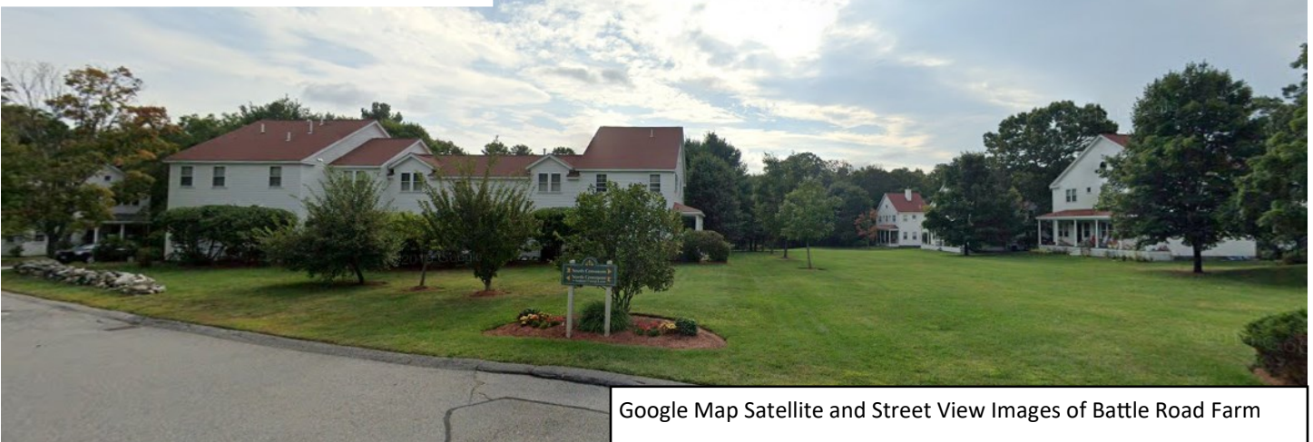
Google Map Satellite and Street View Images of Battle Road Farm